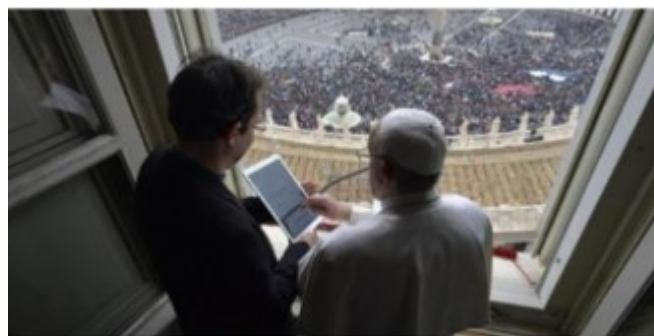
Pope Francis launches the new prayer app

The Android and iOS app includes the Pope's monthly prayer intentions, all of the mysteries of the rosary, and daily prayers for morning, afternoon, and night. In each of these sections, users can click a box to indicate that they have completed the prayer and view how many others also prayed. Source: CNA.